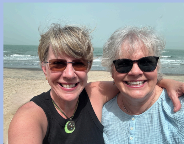
On the beach in Banjul